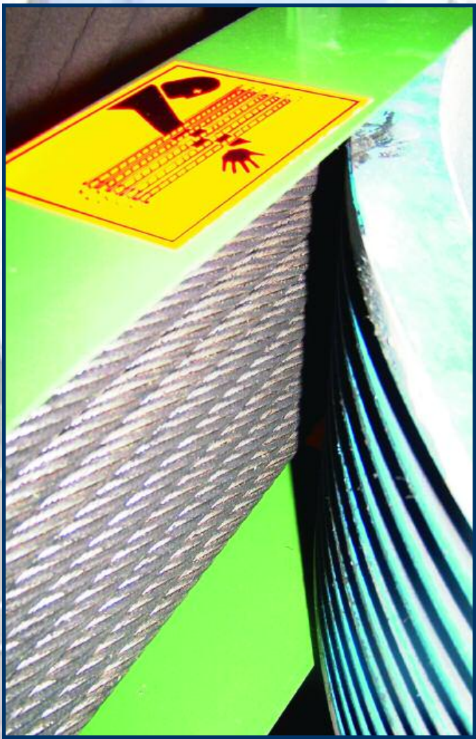
SEVERE PINCH POINT - WORK ALERT, USING EVERY PRECAUTION TO AVOID ACCIDENTS AND INJURIES.

This hand decided to clean oil from a drip pan under a Hydraulic Machine (Elevator Pump unit). This hand did not Lock Out / Tag Out the elevator. This hand went into the pan through the belts to dry a small amount of oil. The motor started to run. This hand had an owner who almost bled to death. This hand was out of work for many months. Thanks to many doctors this hand still works. This hand now uses the Lock Out / Tag Out Program.