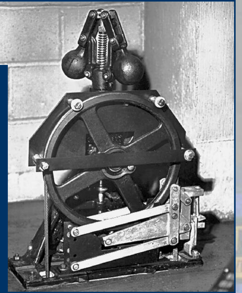
MULTIPLE MOVING PARTS - BE AWARE OF YOUR ENVIRONMENT.