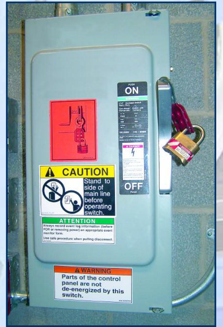
WEIGH THE COST OF WORKING UNSAFE - YOUR LOVED ONES ARE COUNTING ON YOU.

This hand decided to clean oil from a drip pan under a Hydraulic Machine (Elevator Pump unit). This hand did not Lock Out / Tag Out the elevator. This hand went into the pan through the belts to dry a small amount of oil. The motor started to run. This hand had an owner who almost bled to death. This hand was out of work for many months. Thanks to many doctors this hand still works. This hand now uses the Lock Out / Tag Out Program.